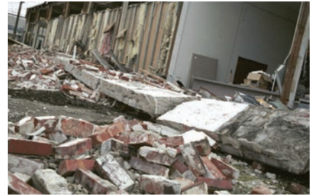
Earthquake damage in Washington in 2001

Scientists are searching for ways to predict earthquakes. They study the historical patterns of earthquakes and monitor the movement of the plates with seismic equipment. While they cannot predict an exact date of a future earthquake, they have a better understanding of when earthquakes are more likely to happen.